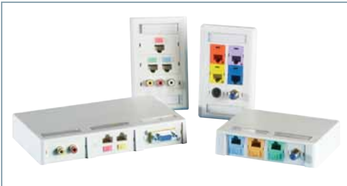
Figure 5. Color-coded multimedia outlets allow easy port identification.

For operating rooms, critical care, and other areas, stainless steel faceplates are available to make cleaning and sterilization easier.