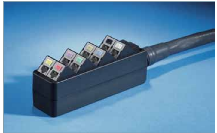
Figure 6. MUTOAs offer a flexible approach to providing multiple outlets.

Multiple user telecommunication outlet assemblies (MUTOAs) provide a flexible approach for areas that might experience frequent re-arrangements or for retrofit applications. These provide a centralized patching area within specific spaces that are fully accessible. Offering up to 24 ports, MUTOAs should be permanently mounted on the wall or in an architectural column. Figure 6 shows a MUTOA. (Note that ANSI/TIA-1179 only recommends MUTOAs for retrofits, not recommended for new hospitals)