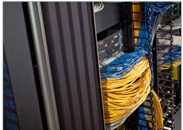
Figure 11. Effective cable management in high-density configurations must prevent stresses on equipment ports while still accommodating MACs

Choosing the right rack and cable pathway components can save money in the long run. Make sure racks and trays can handle future weight requirements. A fully loaded enterprise-level switch can weigh 1600 pounds. While a two-post rack might be fine for patch panels, a four-post rack is the better choice for equipment.