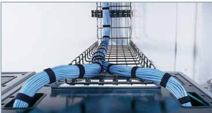
Figure 12. Open cable trays are recommended for pathways for communications cable.

High-voltage wiring and highly sensitive gases and fluids will be encased in closed conduits in their pathways. Therefore, open cable trays (Figure 12) offer a clean and convenient way to route low-voltage communications cable through pathways. They prevent accumulation of debris during and after installation and are available in stainless steel. The open structure makes it easy to ensure correct separation of cables by visual inspection. It can also reduce crosstalk or other electrical performance negative influencers.