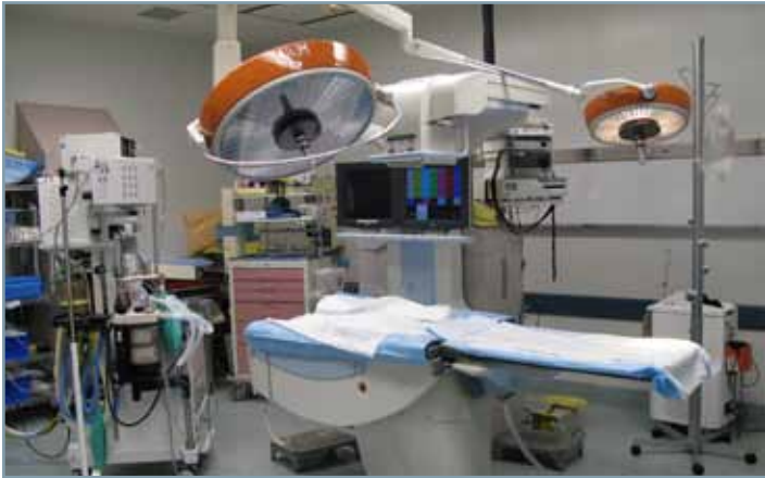
Figure 1. Operating rooms require high cable density and multiple network ports to accommodate needs.

Hospitals and other medical facilities face the daunting challenges of managing information. As patient records, diagnostic information, and even the operating theater all increasingly rely on networked electronics, the amount of data that must be created, transmitted, managed, and stored has grown dramatically. In addition, regulations requiring high levels of data security to protect patient privacy add an additional layer of complexity to information management.